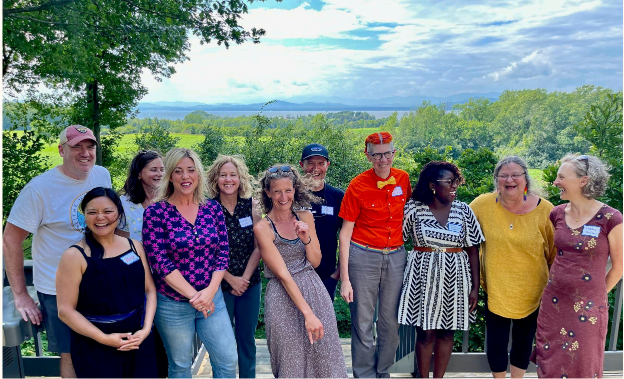
Students & staff at last year's Collaborative Practices for Equity course at Shelburne Farms.