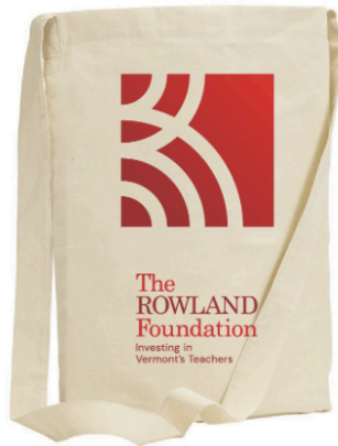
RF Tote – Natural