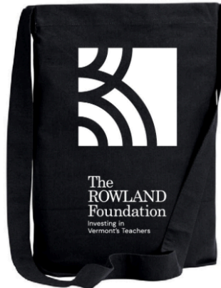
RF Tote – Black