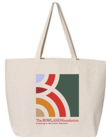
RF Big Tote – Multi