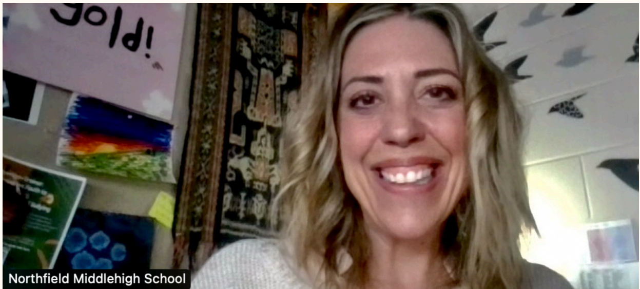
Northfield Middlehigh School